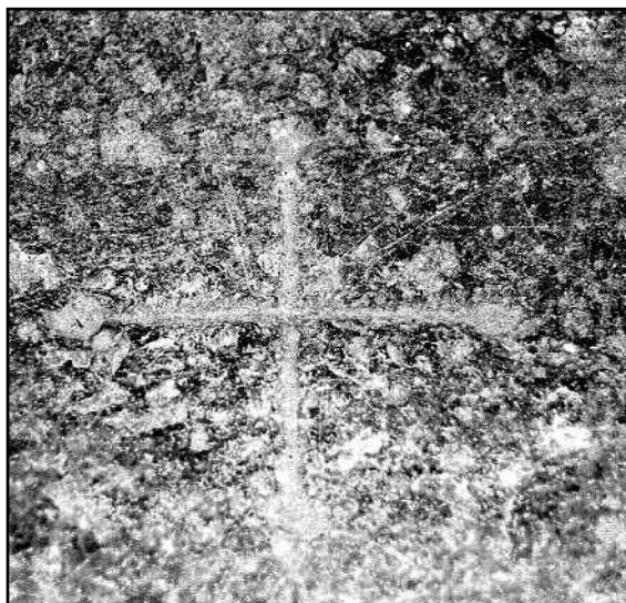
Figure 1. Central cross of the Cley Altar

In Wiveton, the origins of two stone slabs of Purbeck Marble, on either side of the pulpit, are more problematical (figure 2: A and B).