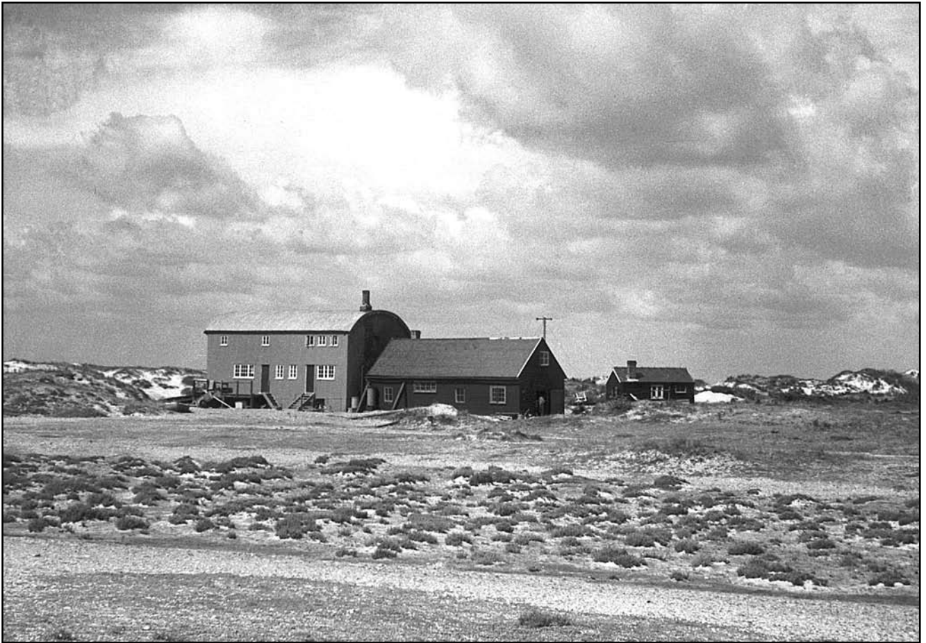
Photograph 3. The Old and New Lifeboat houses