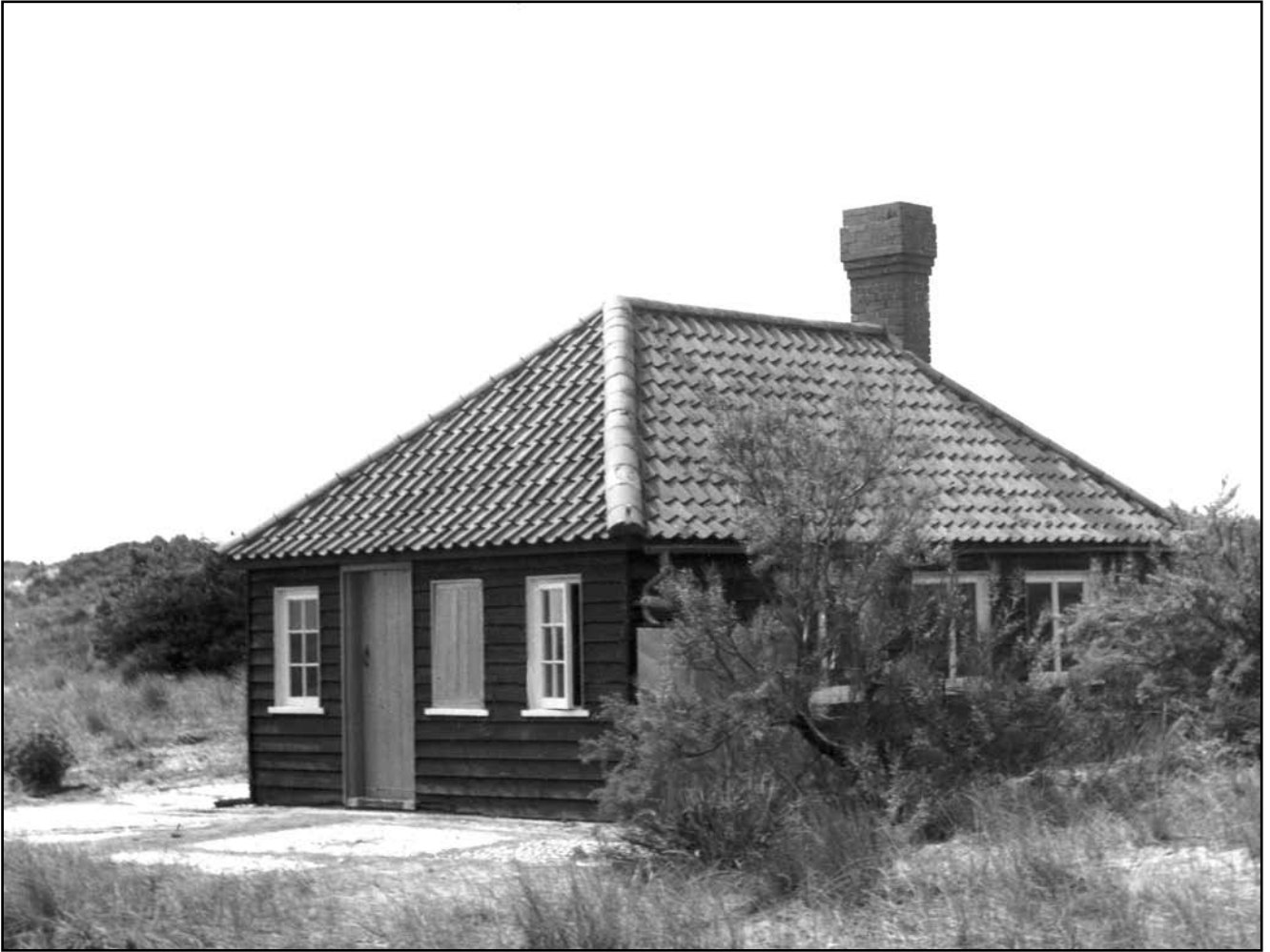
Photograph 1. The laboratory built just south of Glaux Low

Some idea of the amount of pioneer work achieved by Oliver and his associates may be gained by looking at the section on Maritime and Sub-maritime Vegetation (Chapters 40, 41 and 42) in Tansley's "The British Islands and their Vegetation" (1949). 5